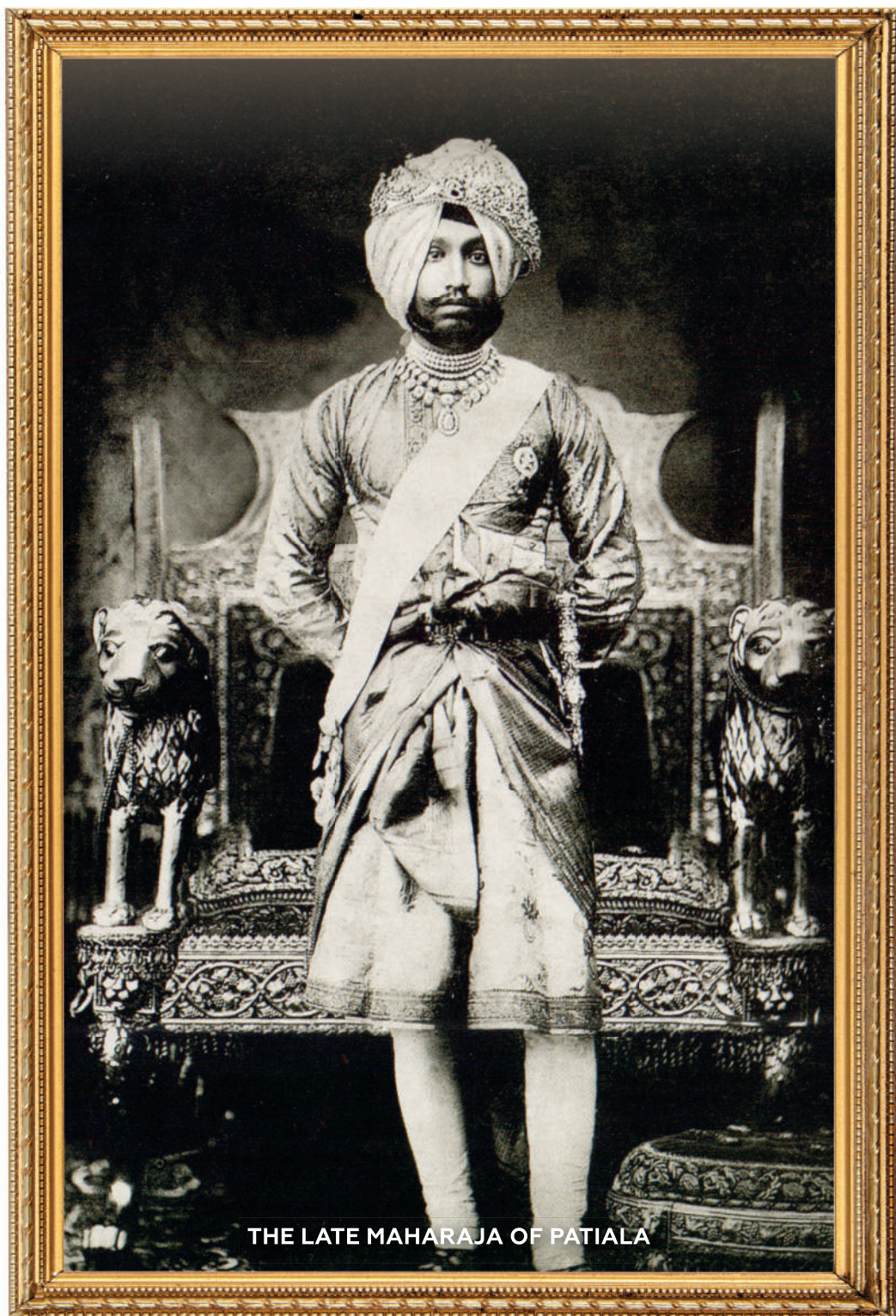
THE LATE MAHARAJA OF PATIALA