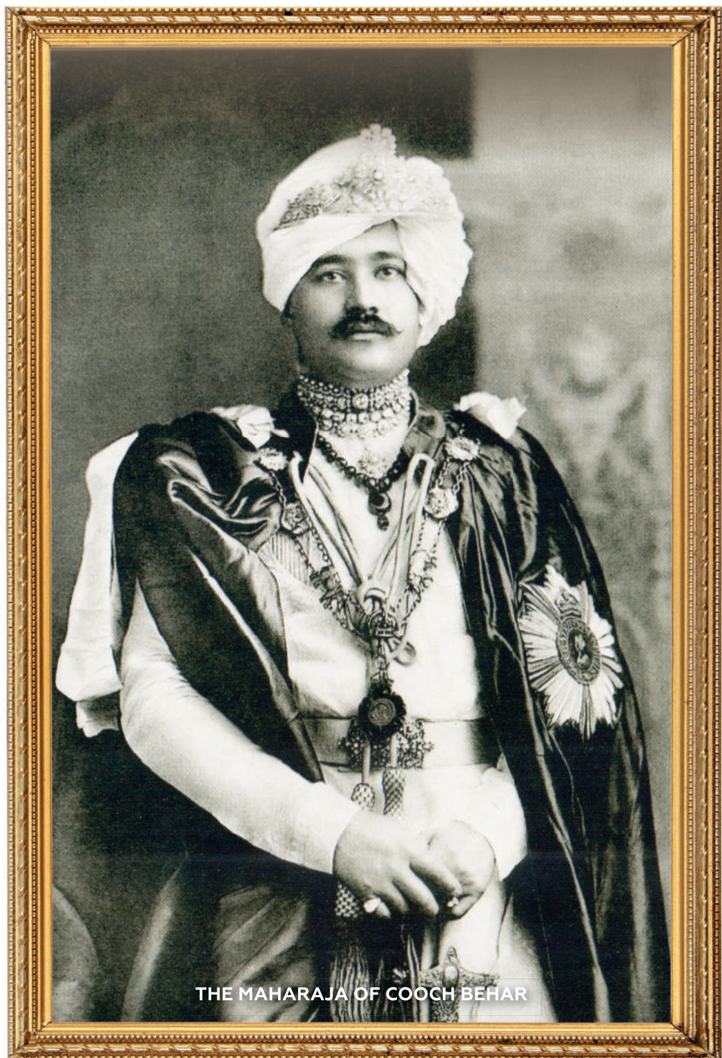
THE MAHARAJA OF COOH BEHAR