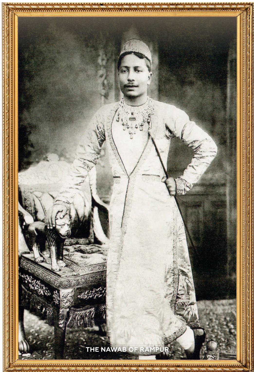
THE NAWAB OF RAMPUR