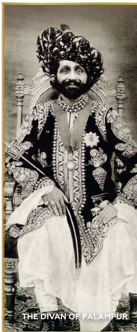
THE DIVAN OF PALAMPUR

Unique blend of complexity and freshness. It has a fine structure, with no tannin