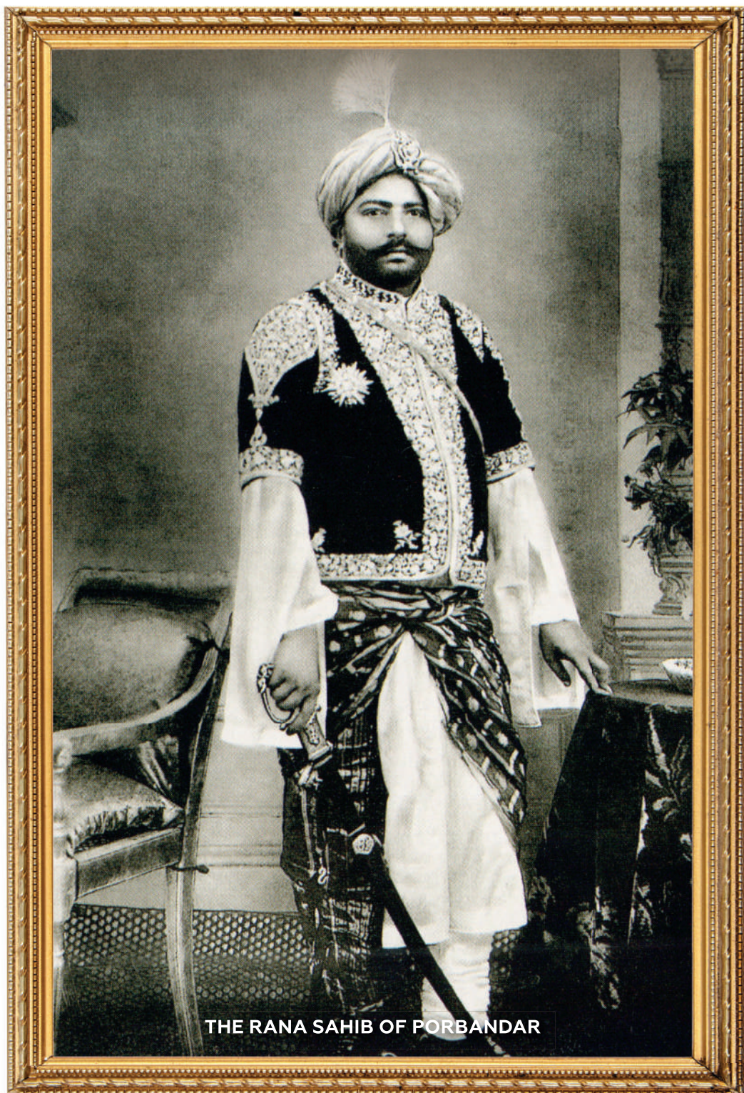
THE RANA SAHIB OF PORBANDAR